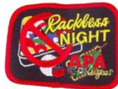
Rackless Night Patch (RN)

Earned only by playing the same skill level or higher . Players must start out by breaking and then win their match without ever racking.