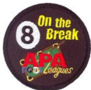
8 On The Break Patch (8OB)

APA 8-Ball Patches are earned by Birmingham APA members who play on an active 8-Ball team in our area. After being noted on their scoresheets, players should receive these patches in their team packets within 2 weeks after earning them.