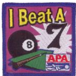
I Beat A 7 Patch (IB7)

Earned by winning against an opponent in league play, City-Cups, or Local Team Championships, who is ranked a SL 7 in 8-Ball.