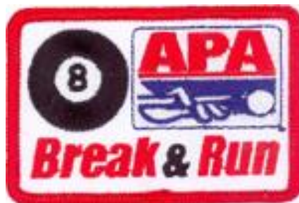
8 Break & Run Patch (8B&R)

Earned by pocketing a ball on a legal break and running the rest of your balls out, including the 8-Ball, without fouling.