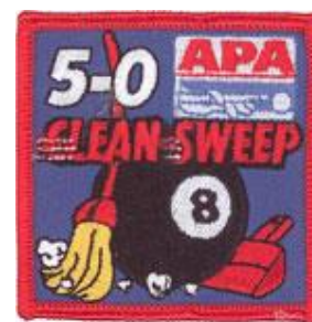
Clean Sweep Patch (8B CS)

Earned when an 8-Ball team wins ALL FIVE of their matches in one night. Only the team members who played receive this patch.