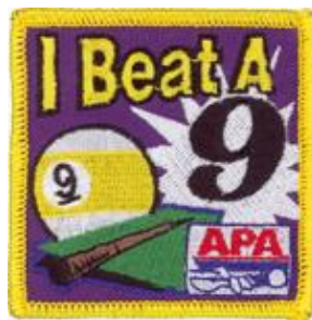
I Beat A 9 Patch (IB9)

Earned by winning against an opponent in league play, City-Cups, or Local Team Championships, who is ranked a SL 9 in 9-Ball.