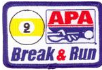
9 Break & Run Patch (9B&R)

Earned by pocketing a ball on a legal break and running the rest of your balls out, including the 9-Ball, without fouling.