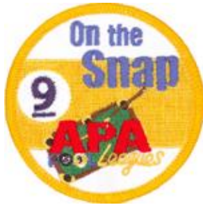
9 On The Snap Patch (90S)

APA 9-Ball Patches are earned by Birmingham APA members who play on an active 9-Ball team in our area. After being noted on their scoresheets, players should receive these patches in their team packets within 2 weeks after earning them.