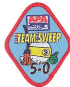
9-Ball Team Sweep Patch (9-Ball TS)

Earned when an 9-Ball team wins ALL FIVE of their matches in one night. Only the team members who played receive this patch.