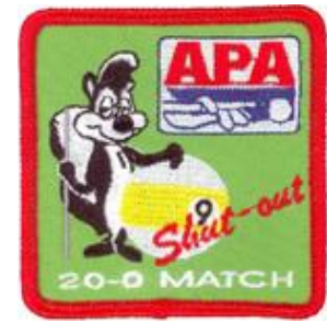
9-Ball Shut Out Patch (SKUNK)

Earned by winning a weekly 9-Ball match by so large a margin of points that you receive 20 match points and your opponent receives 0.