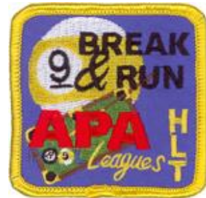
HLT 9 Break & Run Patch (HLT 9B&R)

Earned by making a legal break and pocketing the 9-Ball without scratching or jumping the cue ball off the table. Available to all skill levels in HLT Tournaments.