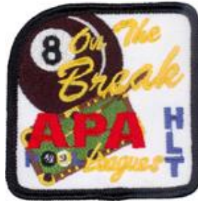
HLT 8 On The Break Patch (HLT 8OB)

Awarded to all players who qualify and play in our 8-Ball & 9-Ball Local Team Championships (LTCs) , held in June of each year. Available to all skill levels who participate in our LTCs.