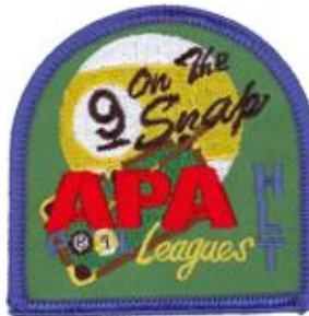
HLT 9 On The Snap Patch (HLT 9OS)

Earned only by playing the same skill level or higher . Players must start out by breaking and then win their match without ever racking. Available to all skill levels in HLT Tournaments.