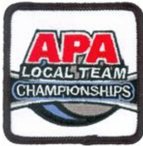
LTC Patch (LTC)

APA High Level Tournament (HLT) Patches can only be earned by Birmingham APA members who play in one of our HLT Tournaments. These HLT tournaments include our APA 8-Ball/9-Ball Tri-Cups and our APA Local Team Championships .