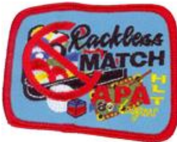
HLT Rackless Night Patch (HLT RN)

Earned by pocketing a ball on a legal break and running the rest of your balls out, including the 8-Ball, without fouling. Available to all skill levels in HLT Tournaments.