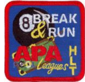
HLT 8 Break & Run Patch (HLT 8B&R)

Earned by making a legal break and pocketing the 8-Ball without scratching or jumping the cue ball off the table. Available to all skill levels in HLT Tournaments.