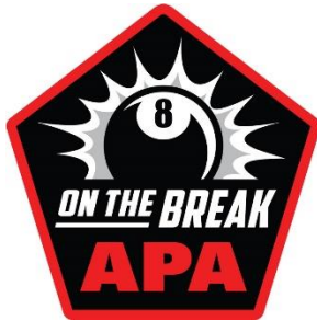
8 On The Break Patch (8OB)

APA 8-Ball Patches are earned by Birmingham APA members who play on an active 8-Ball team in our area. After being noted on their APA Patch Envelope, players will receive these patches in their team packets within 2 weeks after earning them.