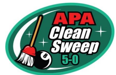
8-Ball Clean Sweep Patch (8BCS)

Earned when an 8-Ball team wins ALL FIVE of their matches in one night. Only the team members who played receive this patch.