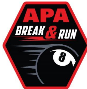
8 Break & Run Patch (8B&R)

Earned by pocketing a ball on a legal break and running the rest of your balls out, including the 8-Ball, without fouling.