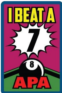
I Beat A 7 Patch (IB7)

Earned by winning against an opponent, who is ranked a SL 7 in 8-Ball, during regular League play, Tri-Cups, or APA World Qualifiers.