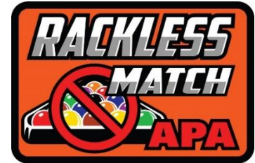
8-B Rackless Match Patch (RM)

Earned only by playing the same skill level or higher . Players must start out by breaking and then win their match without ever racking.