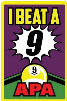
I Beat A 9 Patch (IB9)

Earned by winning against an opponent, who is ranked a SL 9 in 9-Ball, during regular League play, Tri-Cups, or APA World Qualifiers.