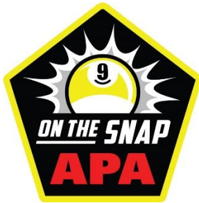
9 On The Snap Patch (9OS)

APA 9-Ball Patches are earned by Birmingham APA members who play on an active 9-Ball team in our area. After being noted on their APA Patch Envelope, players will receive these patches in their team packets within 2 weeks after earning them.