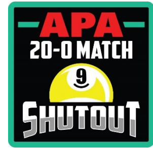
9-Ball Shut Out Patch (SKUNK)

Earned by winning a weekly 9-Ball match by so large a margin of points that you receive 20 match points and your opponent receives 0.