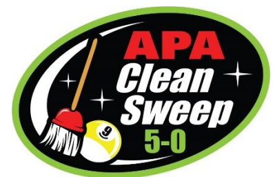
9-Ball Team Clean Patch (9-Ball TS)

Earned when an 9-Ball team wins ALL FIVE of their matches in one night. Only the team members who played receive this patch.