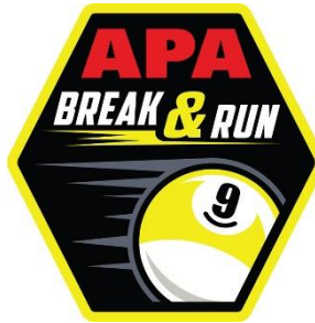
9 Break & Run Patch (9B&R)

Earned by pocketing a ball on a legal break and running the rest of your balls out, including the 9-Ball, without fouling.